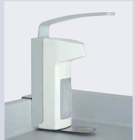
Disinfectant dispenser with drops collector RE3955002IN