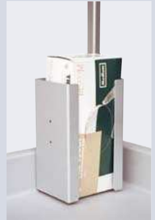
Disposable gloves holder RE3955001IN