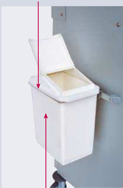
Waste bin holder BLDNG0001