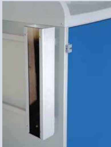
Catheters and probes holder RE3955001PC